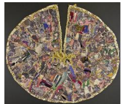
Eleanor Bostwick , “W” Highlights, 1992, fabric, 47” diam.

This exhibition features 15 Arizona artists that transform cloth and thread into contemporary artworks. These fiber artists design, sew and fabricate their creations based on their experiences, imagery and ideas rather than traditional patterns. Many of these artists have used fabric-working techniques such as hand-dyeing, piecing, stitchery, appliqué and quilting. Others have used art processes such as printing, painting and drawing while some have repurposed clothing or photographic imagery into their works. They are all practicing the Art of Cloth.