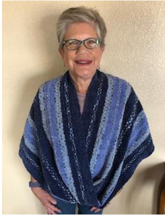
Lee's Mobius shawl, with a supplementary warp of rayon chenille with art yarn floats