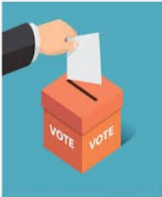
CREATED BY VECTORPORTAL.COM

*Write-in candidates are allowed, with permission of nominee.